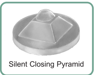
Silent Closing Pyramid