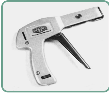
Part No. 0998