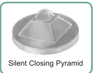
Silent Closing Pyramid